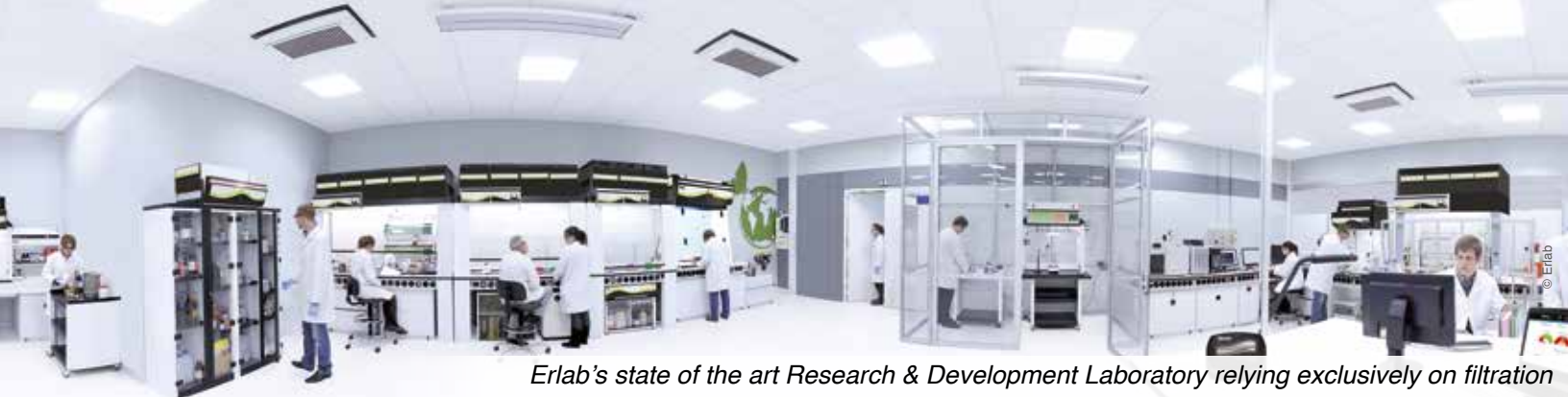
Erlab's state of the art Research & Development Laboratory relying exclusively on filtration