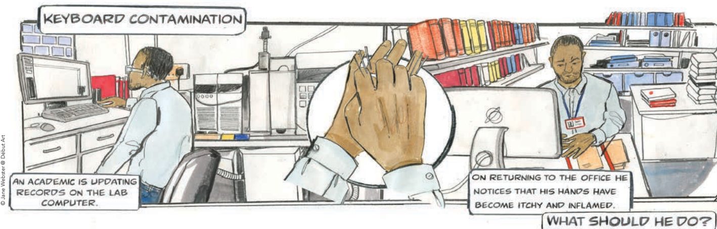
© Jane Webster © Debut Art